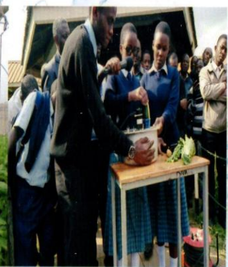
A newly invented machine for cutting veggies by Edmund Rice Young Scientists