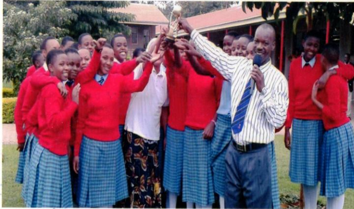
Best Students Receiving Awards