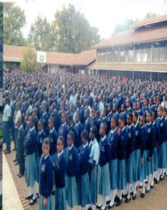
ERSSS Students During Assembly