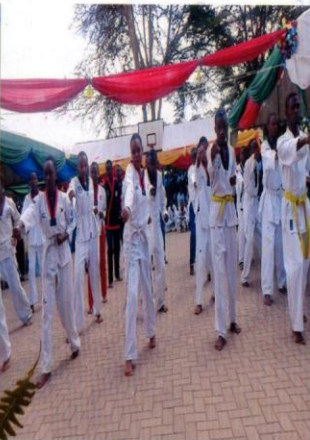
ERSSS Taekwon-do group demonstration during graduation