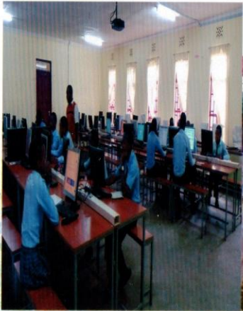
ERSSS students with their teacher in the process of learning Information Computer Studies