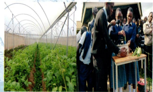
Green House as one of the school projects for Agro - business

"Study with us today and experience the real world of science and technology"